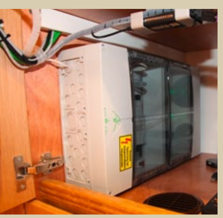
Ventilated, rubberized KNX<sup>®</sup> interface and line sub-distribution

With KNX<sup>®</sup> you experience almost unlimited possibilities of application – from the alarm system over the regulation of heating, climate and ventilation up to multimedia, convenience and safety packages. Special importance was attached to alleged details. So, freely configurable dimming parameters are integrated in the KNX<sup>®</sup> depending on day/night operation as well as a KNX<sup>®</sup> touch cleaning control to detect operating errors. Safety-relevant data such as water invasion & locating information are immediately reported all over the ship by means of voice response.