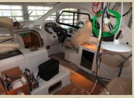
Installation chaos during the system integration